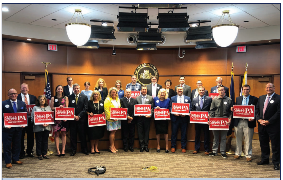
The county commissioners join county row officers, directors and America 250 Pa. volunteers. Visit <u>America 250 pa.org</u>.